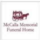
McCalla Memorial Funeral Home